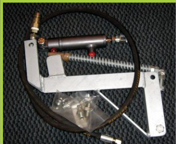
hydraulic remote ALL MODELS EXCEPT SP