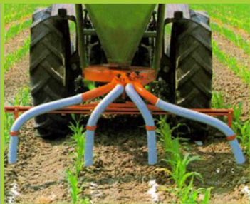
four row discharge kit SP & SR/S RANGE ONLY