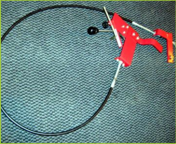
cable remote ALL MODELS EXCEPT SQTF & TORNADO