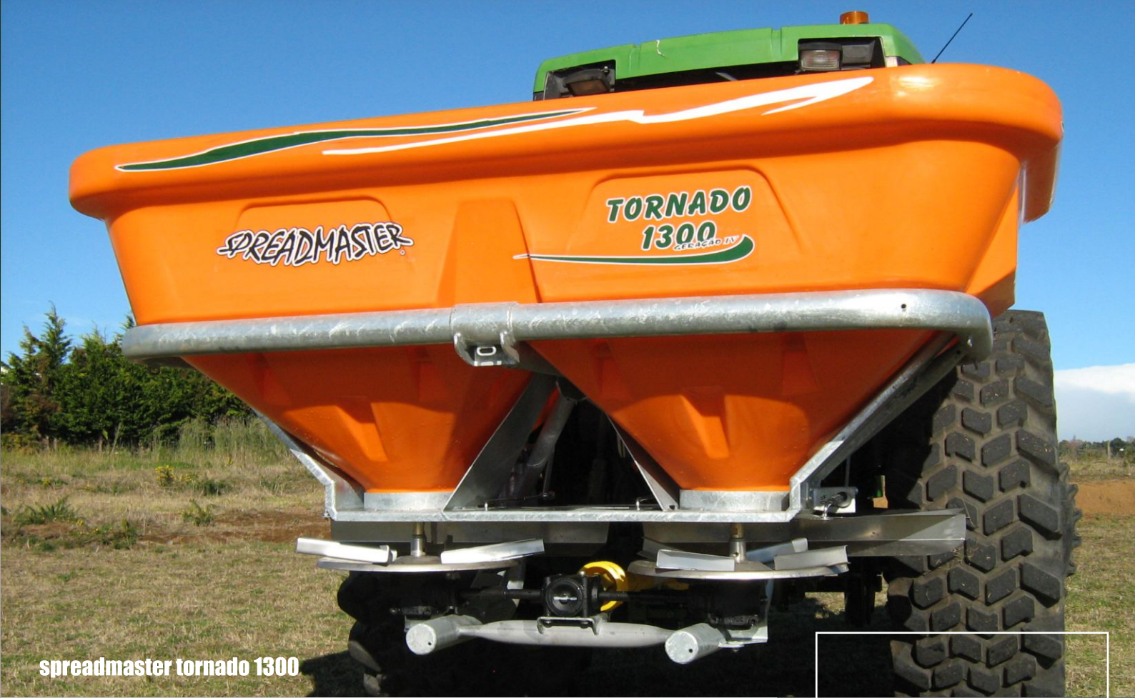
spreadmaster tornado 1300

The “Spreadmaster”, tractor 3 point linkage mounted spreader range, will have a model to suit your expectations, and operation.