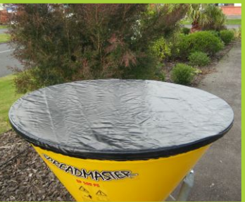
cover ALL MODELS