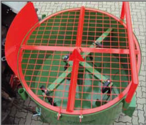
Mixing paddles on DBM750