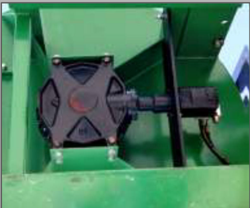
Optional hydraulic drive