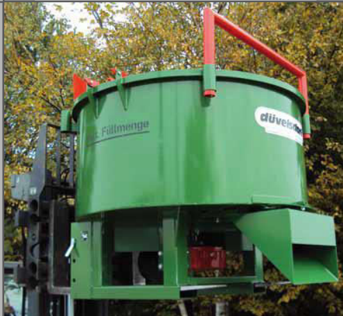
DBM1250 on forks