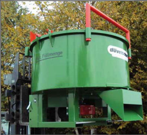
DBM750 on forks