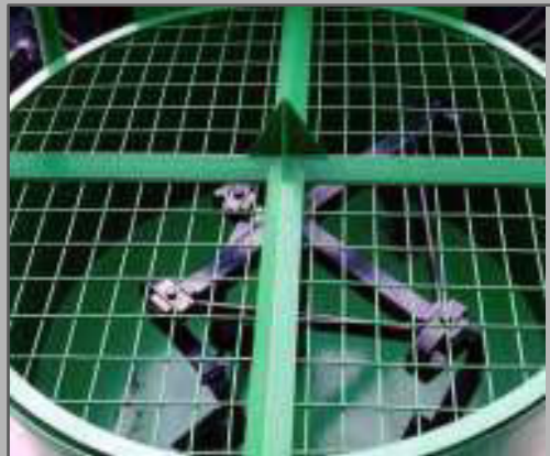
Mixing paddles on DBM750 (5 paddles on a DBM1250)