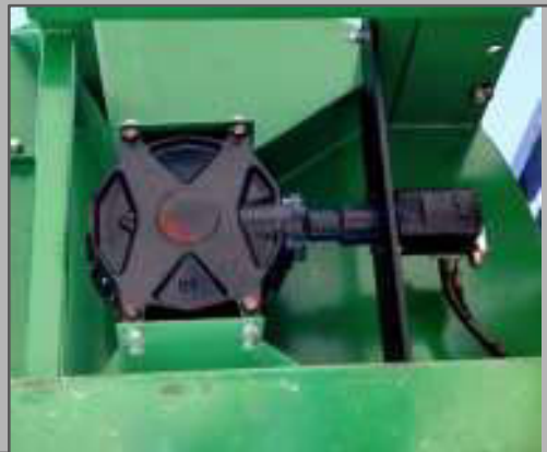
Optional hydraulic drive