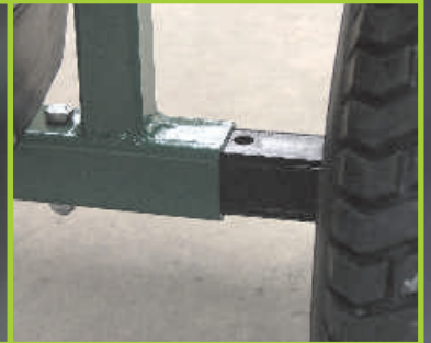
Variable wheel width