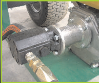
Robust Hydraulic Drive