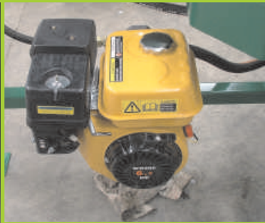
6.7 HP 4 Stroke engine